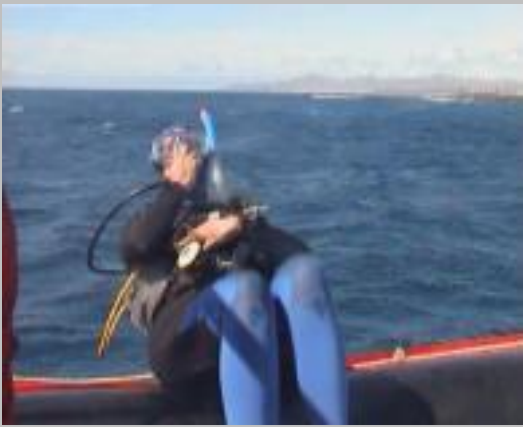
RESORT SCUBA DIVER