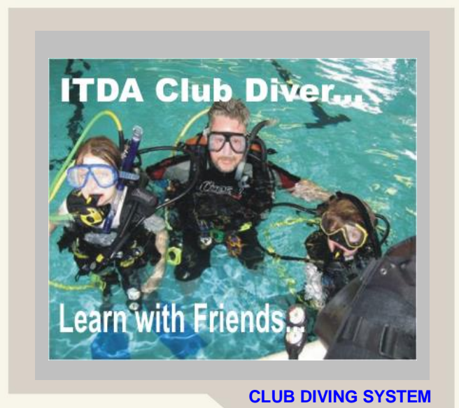
CLUB DIVING SYSTEM