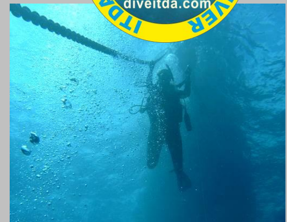
SPORTS SCUBA DIVING