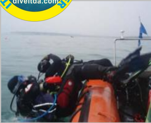
ADVANCED SCUBA DIVER