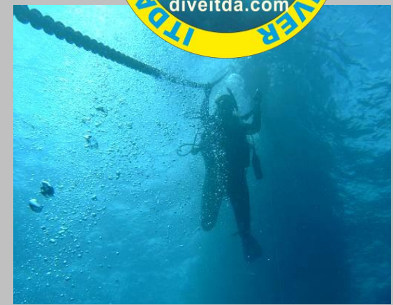
SPORTS SCUBA DIVING